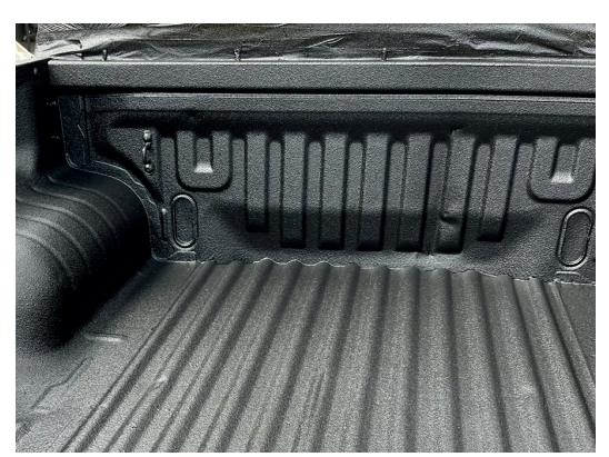
f 🞯 🎔 (in) www.polyshieldex.co.za